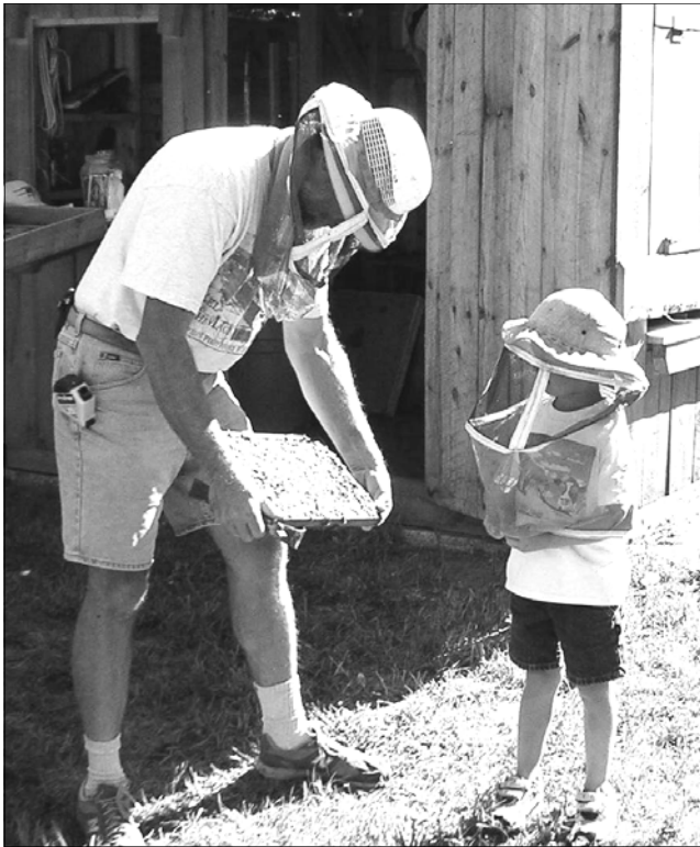
Will there be a next generation of beekeeper?

I look forward to seeing you at the ISBA Fall Meeting at the Illinois Department of Agriculture on November 18, 2006.β